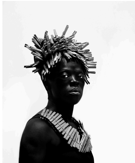
Left to right: ARNOLD, Annie Leibovitz Art Edition. Zanele Muholi, Bester I, New York, 2019

Opening Night Preview and Reception Monday, July 29, 2024, 6–9pm. Purchase Tickets and information here