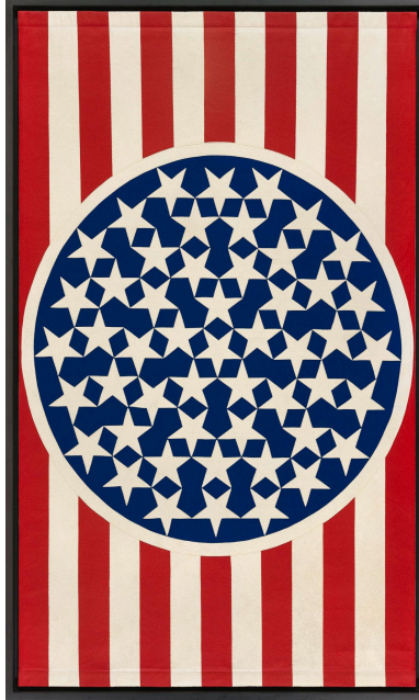
Robert Indiana, New Glory Banner, 1963