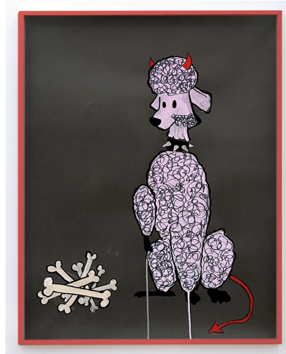
Adam Stamp, The Collector , 2024.