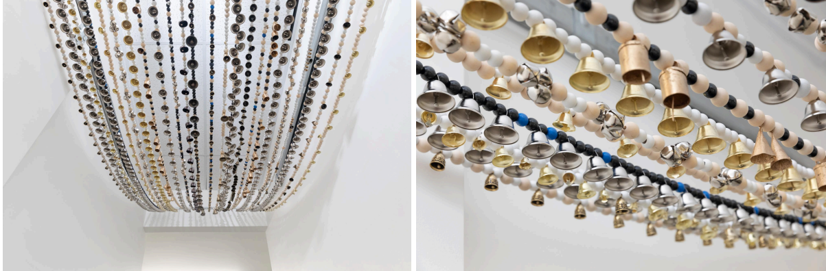
Crystalle Lacouture, Epistle , 2023, at Praise Shadows Art Gallery, photo by Dan Watkins.