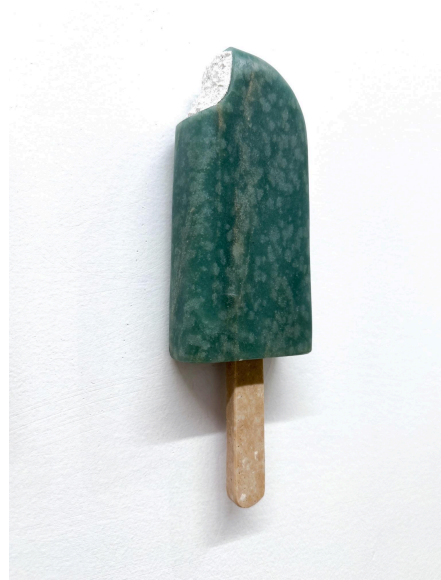
L to R: James Benjamin Franklin, Knell , 2025, acrylic, fabric, plaster, mica, and epoxy on extruded polystyrene, 73 x 73 x 3 1/4 in, 185.4 x 185.4 x 8.3 cm, courtesy of Library Street Collective; Juan Miguel Quiñones, White Ice Cream , 2025, carrara white marble, travertine and epoxy resin, 21.5 x 7 x 3cm, courtesy of IRL GALLERY