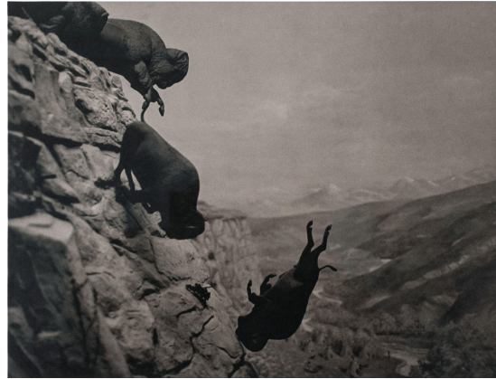
L to R: Roméo Mivekannin, The Dancer, after Yayoi Kusama , 2026, acrylic, elixir bath on velvet, 94.5 x 59.1 in. | 240 x 150 cm; Willem de Kooning, Untitled (Head) , 1951; David Wojnarowicz, Untitled (Buffaloes) , 1988, printed 1994, platinum print on rag paper, 10 5/8 x 13 7/8 inches, Edition 70 of 100.

The Aspen Art Fair VIP Preview Day: Wednesday, July 29, 2026 11am–6pm | Tickets HERE