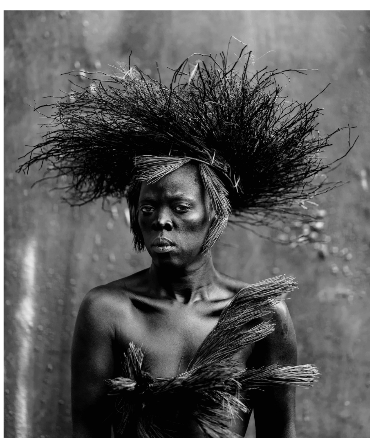
Zanele Muholi, Isiqhaza II , Philadelphia, 2018, Courtesy Zanele Muholi