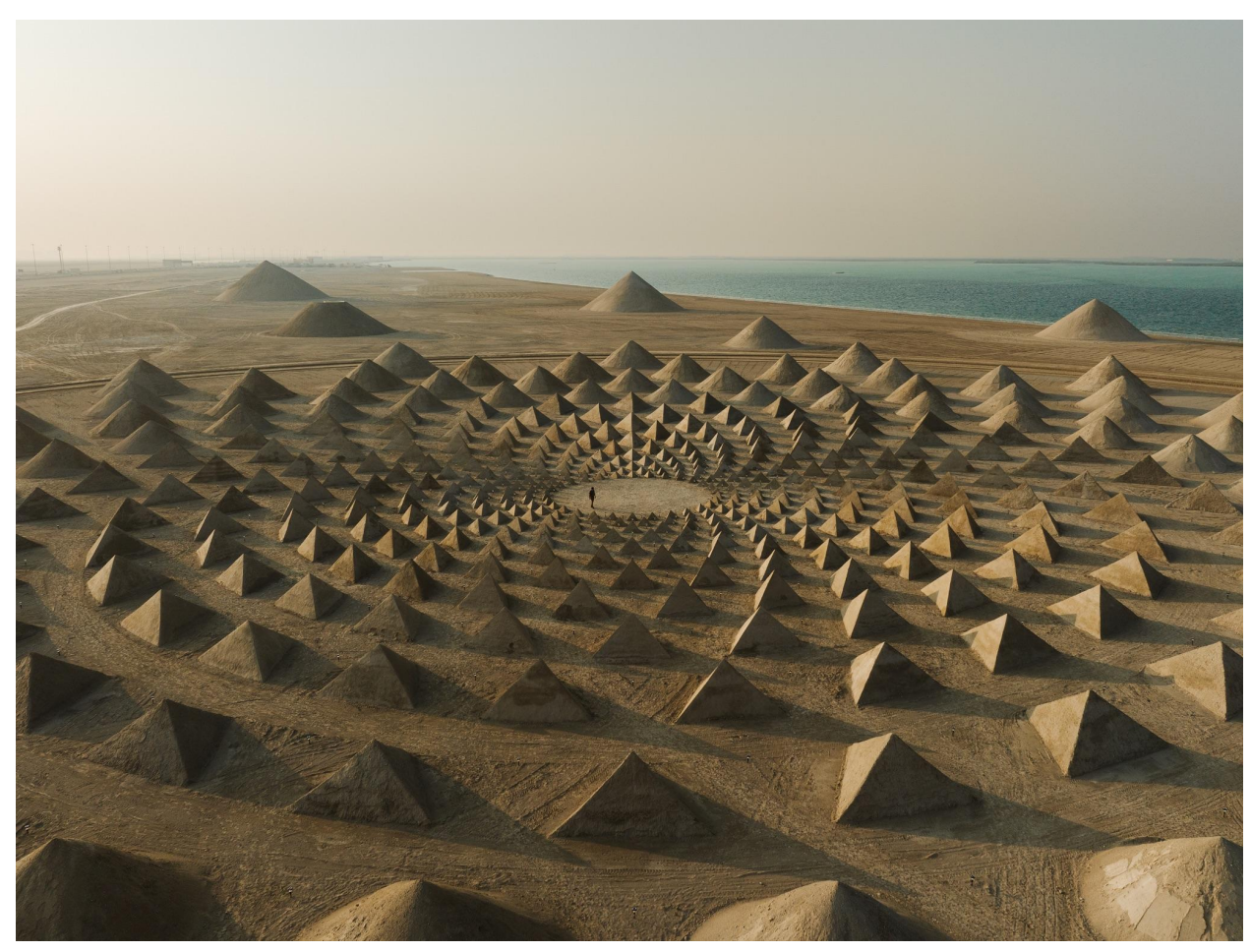
Aerial view of Jim Denevan, Self Similar at Manar Abu Dhabi

Towering clouds, a breath of air, tiny grains of sand, tall mounds and mountains, wind, and weather systems, drops and bodies of water, pyramids, small and large