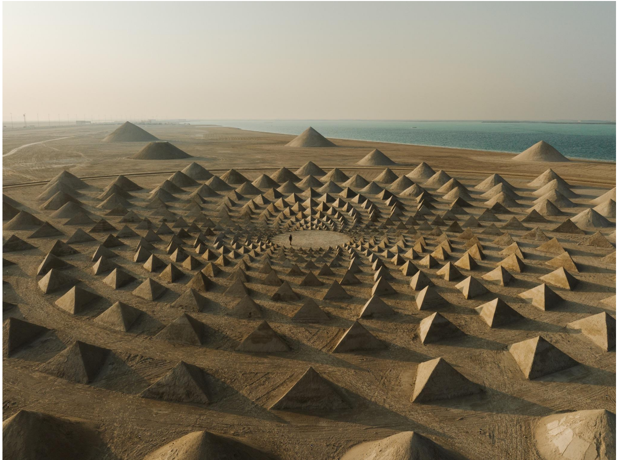
Aerial view of Jim Denevan, Self Similar at Manar Abu Dhabi

Towering clouds, a breath of air, tiny grains of sand, tall mounds and mountains, wind, and weather systems, drops and bodies of water, pyramids, small and large