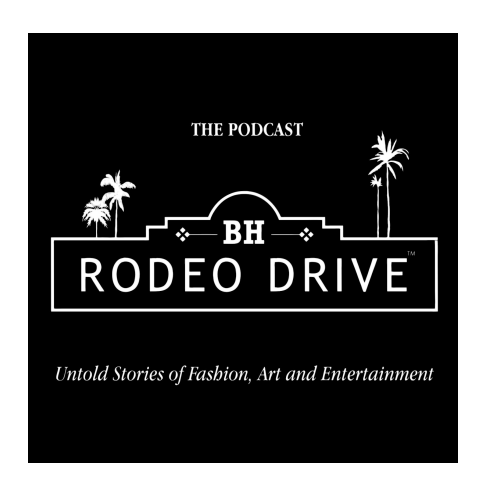
Episode 4 Launches Today