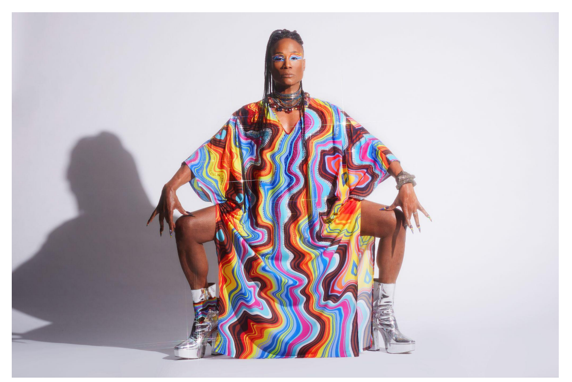
Pages 110–11: Billy Porter in the Billy Porter Pride kaftan, Oday Shakar for KAFTKO. Andrew Egan

"It is this wonderful garment of comfort that's size inclusive, that's gender fluid, that can be modest or sexy. It can be voluminous or follow the lines of the body, it can be luxurious, or very accessible."