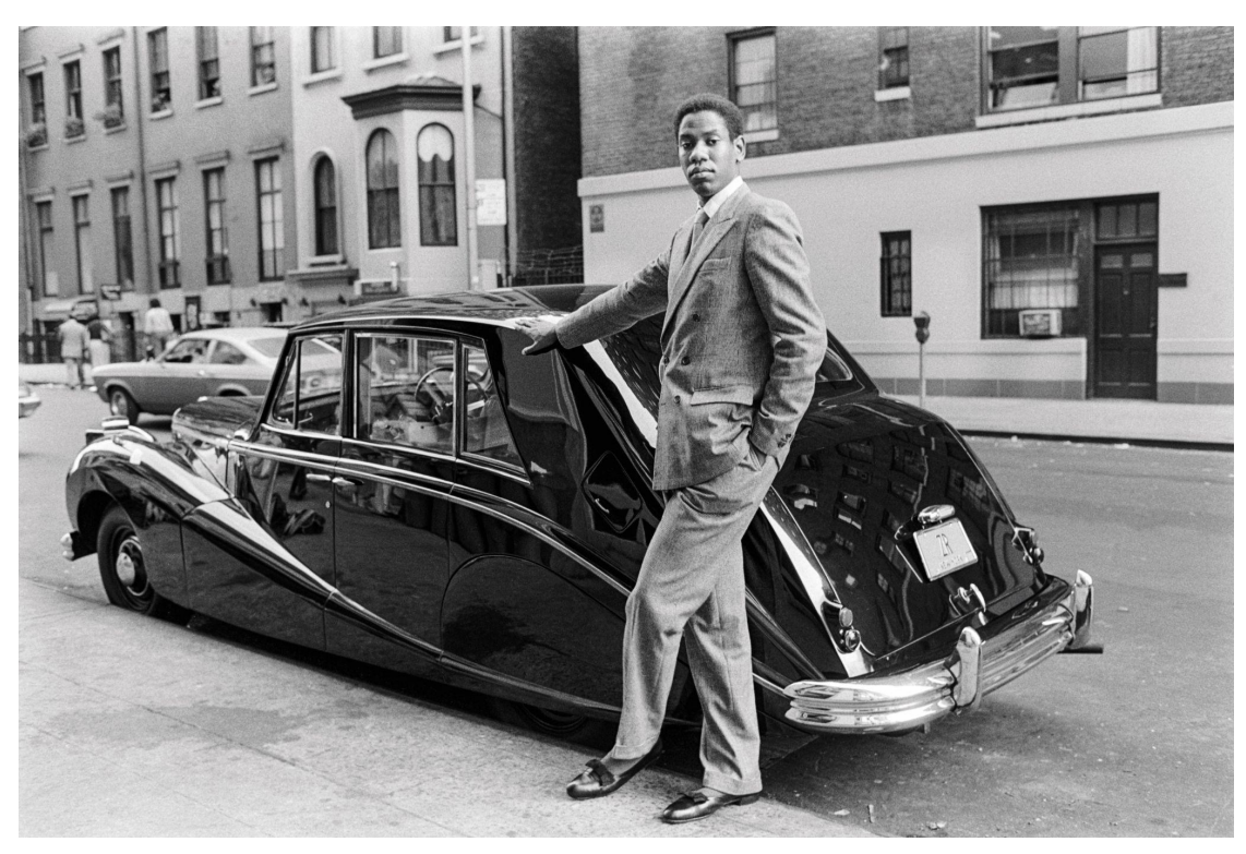
André Leon Talley poses in front of a luxury car in New York, 1979. From BLACK IN FASHION, published by Union Square & Co. in 2024.

The late André Leon Talley recalled this momentous event in conversation with the authors before his passing. "You could almost just reach out and touch the energy they gave in the air. It was like quiet thunder, and because everyone saw that and felt that at the battle, French designers – Givenchy, Yves Saint Laurent – they started wanting black models."