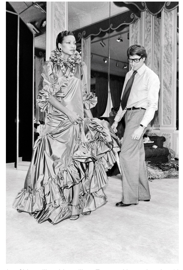
Left: The iconic Josephine Baker performs onstage at the Battle of Versailles, Versailles, France, November 27, 1973. From BLACK IN FASHION , published by Union Square & Co. in 2024. Right: Designer Yves Saint Laurent and his muse, Mounia Orosemane modeling a gown from his spring 1979 couture collection. From BLACK IN FASHION , published by Union Square & Co. in 2024.