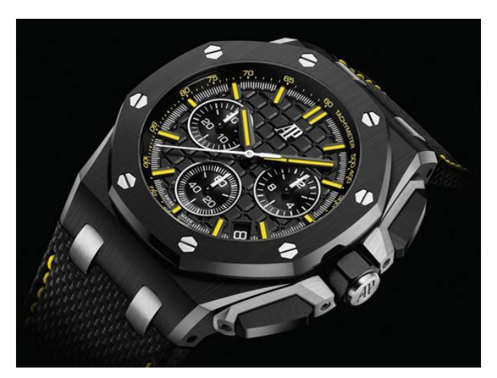
Audemars Piguet Royal Oak Offshore black ceramic chronograph inspired by the Limited Edition "End of Days" released in 1999 in collaboration with Arnold Schwarzenegger.