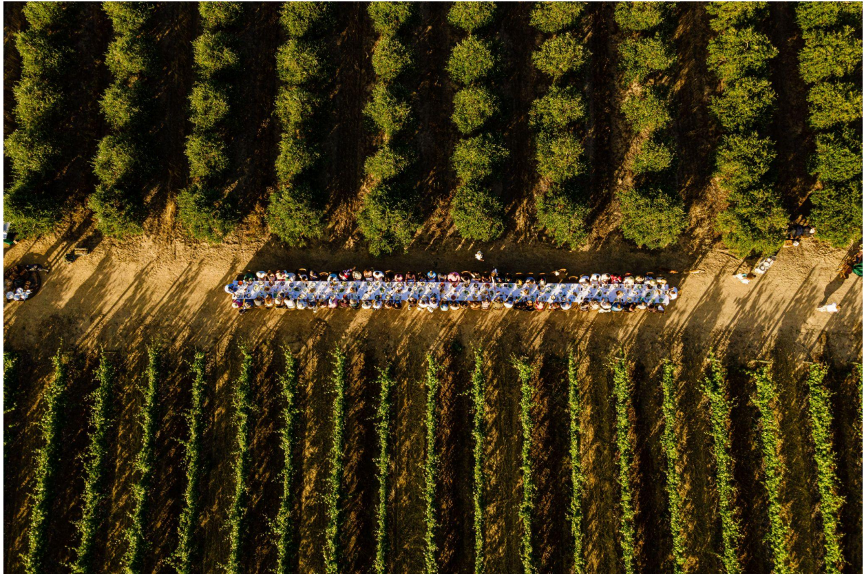
Kleinood Farm & Winery, Stellenbosch, South Africa