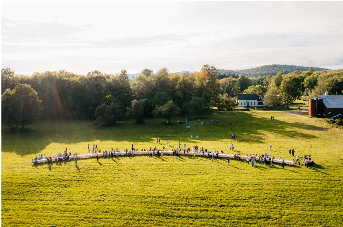
Sage Farm Goat Dairy, Stowe, VT