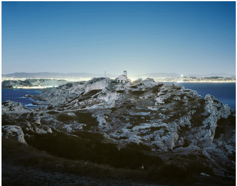
L to R: Alice Guittard, Un été grec, la pluie , 2023, Marble inlay, 67 x 61 x 2,5 cm · 26,5 x 24 x 1 in, Courtesy the artist & Double V Gallery, © Joseph Alexiadi; Sébastien Normand, Périgée au Frioul , 2011 / 2015