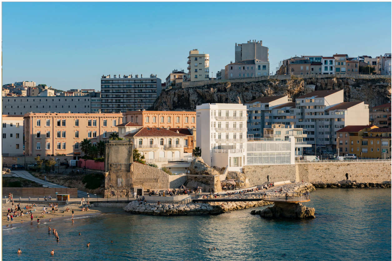
Les Bords de Mer, Marseille, France

la mer promises a summer escapade that celebrates Marseille's cosmopolitan heritage as France's oldest city and now as a global art and cultural destination. It is a reflection of Hoffman's curiosity and commitment to establishing undiscovered opportunities for meaningful cultural dialogue, connection and education among artists, dealers, collectors, art aficionados and cultural practitioners around the world.