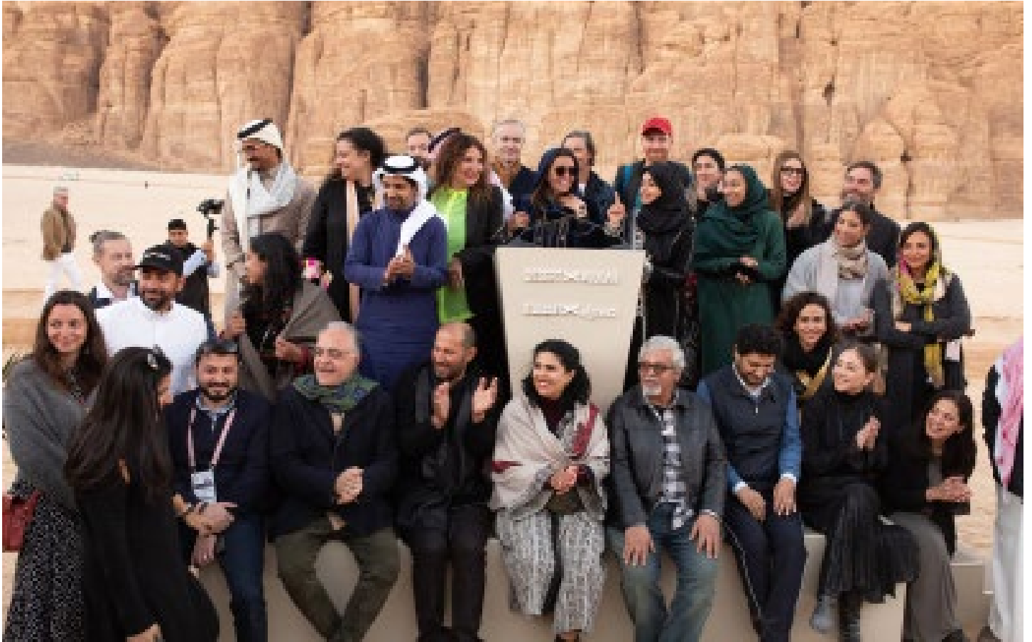
— Artists at Desert X AlUla