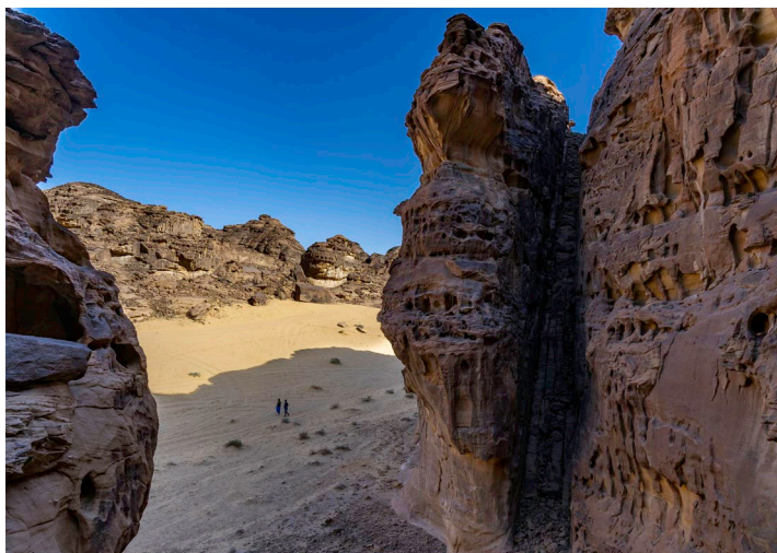
— Creatives explore the AIUla landscape