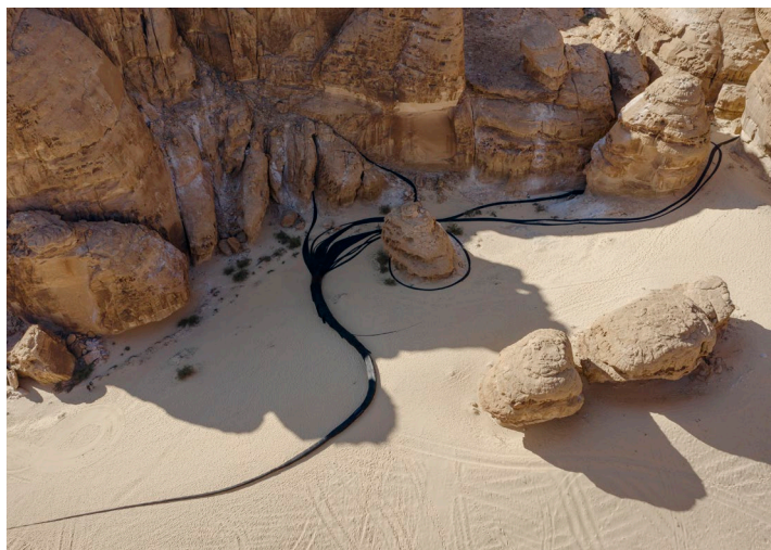
— Muhanad Shono, The Lost Path , installation view at Desert X AIUla 2020, photo Lance Gerber, courtesy the artist, Athr Gallery and Desert X AIUla. Shono is currently part of AIUla pilot artist residency programme, until January 2022