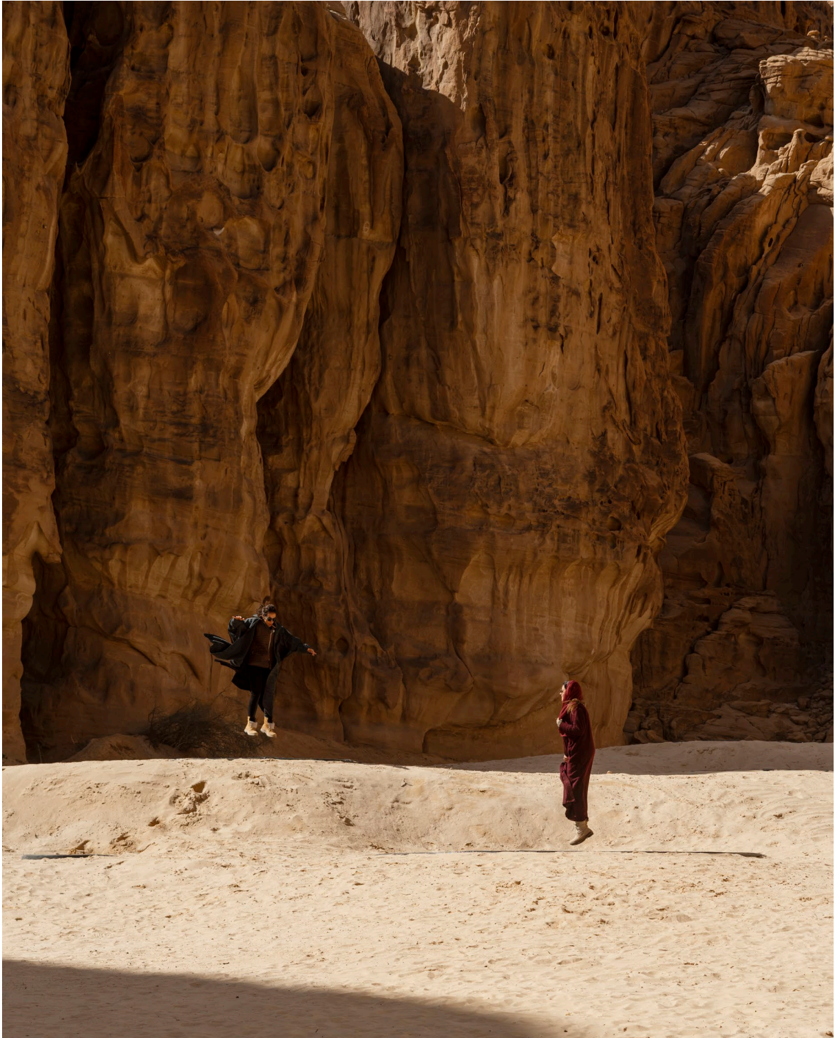
— Visitors jump on Manal AlDowayan's Now You See Me Now You Don't at Desert X AlUla 2020