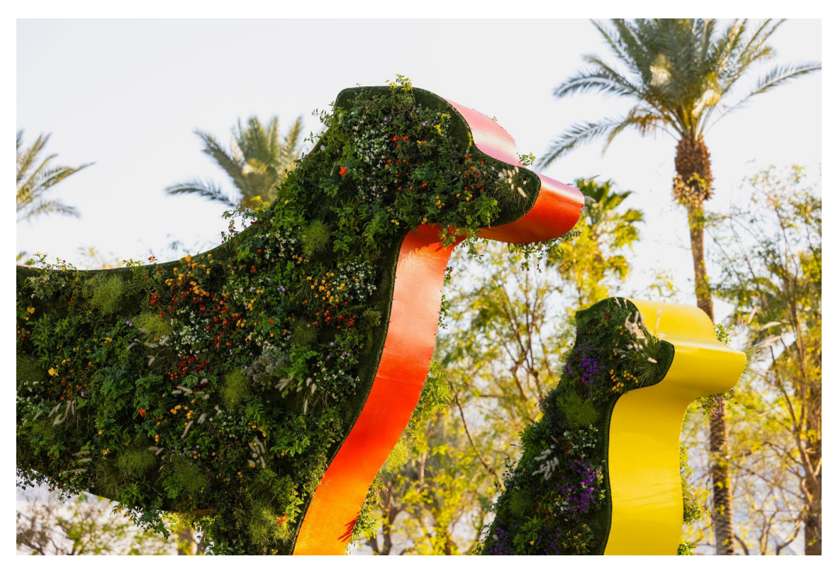
Mutts by Oana Stănescu.