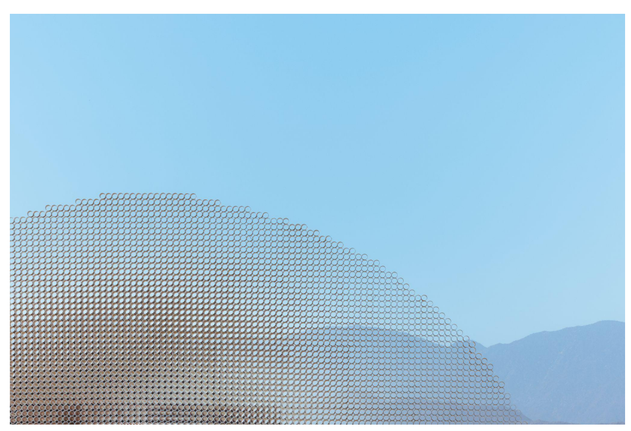
Circular Dimensions x Microscape by Cristopher Cichocki, photo Lance Gerber, courtesy Coachella Valley Music and Arts Festival.

Indio, CA (April 15, 2022) — The Coachella Valley Music and Arts Festival 2022 opens its doors to the public today, revealing a series of specially-commissioned, large-scale installations by 11 international designers, architecture and design studios and experimental artists who are working at the forefront of today's contemporary visual culture in Europe, Latin America, the UK and the United States, including the Coachella Valley.