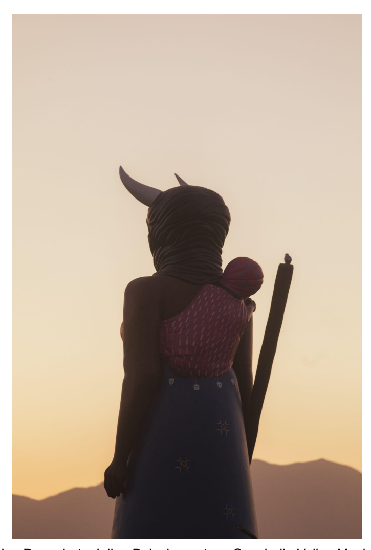
La Guardiana by LosDos