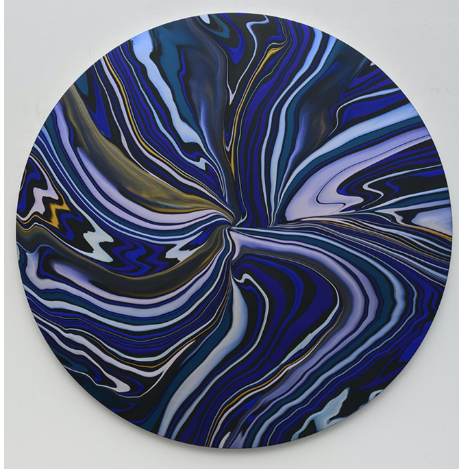
Geodesy 1505 , 2019, acrylic on canvas over circular wood panel, 72" diameter.